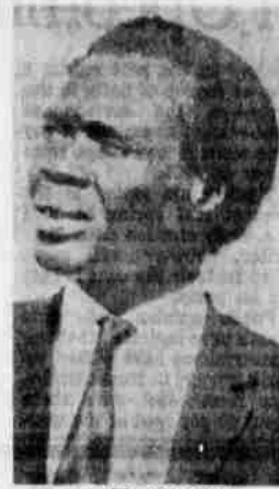
A. M. OBOTE Prime Minister

He became active in the trade union movement. Now 37, he is prime minister of Uganda, facing Africa's problems of disease, poverty, ignorance and tribalism plus special problems peculiar to Uganda. This is a nation of seven million without a national consciousness. National independence means nothing to 9 out of 10 people. Obote himself admits that when he was first elected to the colonial legislative council four years ago, he had difficulty deciding whether he represented his tribe, his party, the electorate of his constituency or the country at large. Included in this nation of 94,000 square miles are four kingdoms, one territory and eleven administrative districts. The kingdoms and the territory of Busoga all have their own legislative bodies and administrations apart from the national parliament and administration. Such traditional rulers as the Kyabazinga of Busoga, the Omukama of Bunyoro, the Omukama of Ankole, the Omukama of Toro and the Kabaka of Buganda compete with the prime minister for prestige. On a lower level are dozens of chiefs among 28 tribes. Except in Kampala, the ordinary man of Uganda never raises his sights above the local chief except for the Omukamas and the Kabaka. The most important, the most sartorially gorgeous and probably the wisest of these state rulers is the Kabaka Mutesa II of Buganda who