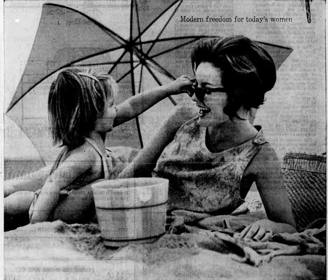
Modern freedom for today's women