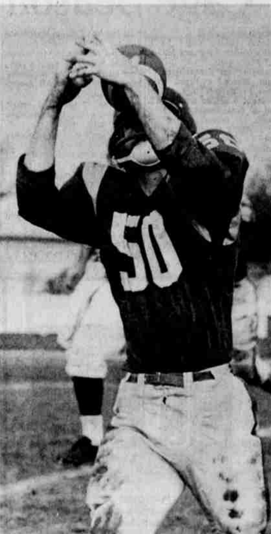
at right, he bobbles pass. The Pirates, highly favored over Thurston, escaped with a 6-0 win over the Colts. (Story, page 2B)