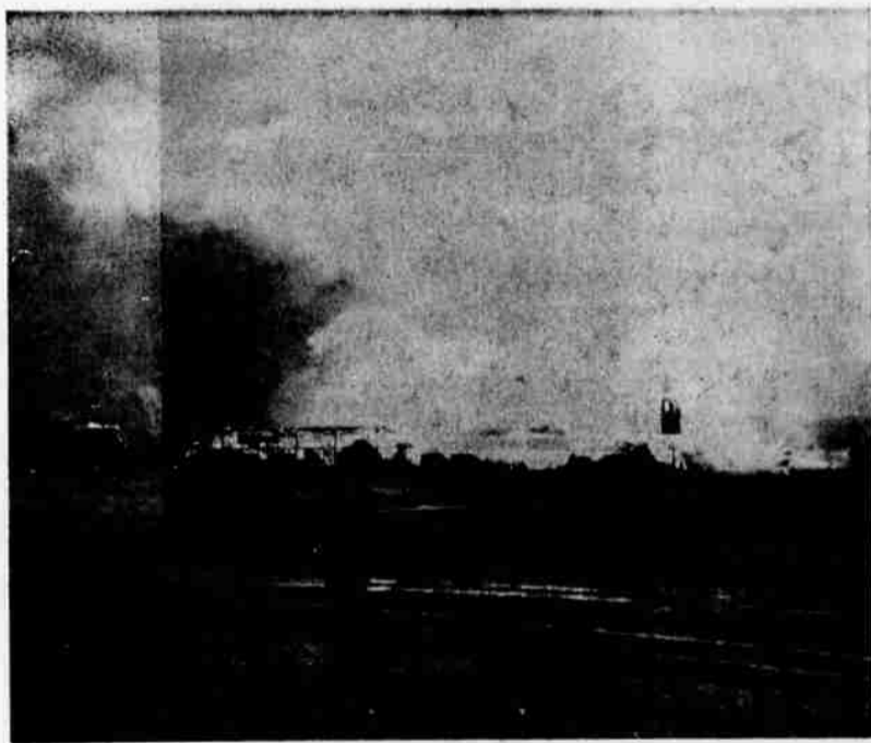
In a period of two hours Friday evening Junction City experienced the worst disaster in its history. Flames fanned by high winds destroyed a two-block area in the southeastern portion of the city. From the top clockwise are: An aerial view of the burned out area taken at 9 a.m. Saturday; a boxcar loaded with "mill run" grain still was burning 15 hours after the warehouse fire began; furniture moved into the street so it wouldn't receive water damage from fire hoses was soaked by rain instead before it could be removed from the street; the brick from this fireplace and chimney was the only salvageable material from one the six houses declared a total loss; Mrs. George (Amelia) Wilhelm tried to get someone to help her remove this religious statue from her home at 222 Greenwood St. but Saturday it stood stoically in the corner amid charred debris; photo of the warehouse at the height of the fire was taken by Eugene businessman E. Lynn Harris. The view is looking toward the northeast.