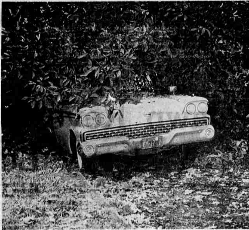
This shot of an auto peeking out of the bushes was taken shortly after the heavy winds struck the Eugene area. There was no accurate estimate of damage due to dents in cars, but body and fender workers will be busy for months.