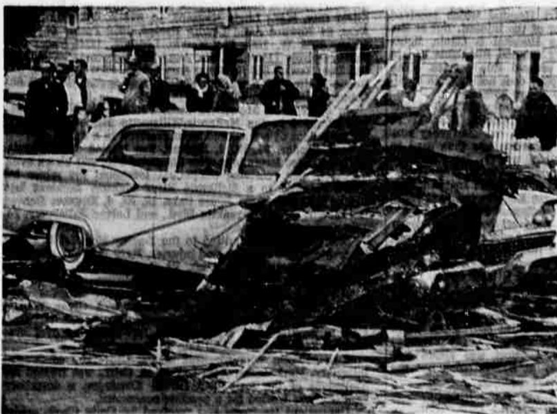
Another damage scene was at the Amazon housing project for married University of Oregon students. One student was killed by flying debris from the roof of nearby Roosevelt Junior High School. This car was stopped cold by flying lumber.