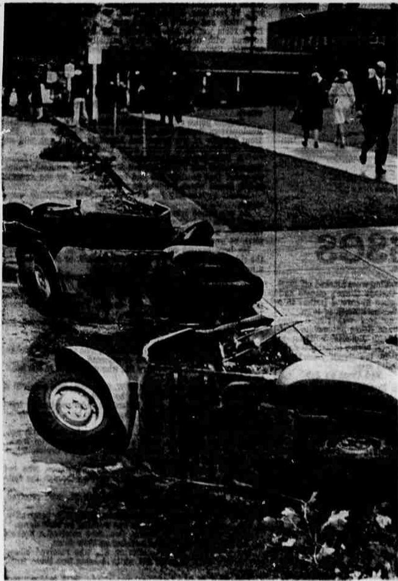
Three little scooters were tipped over in front of the Student Union Building on the University of Oregon campus when Friday's winds bore down.