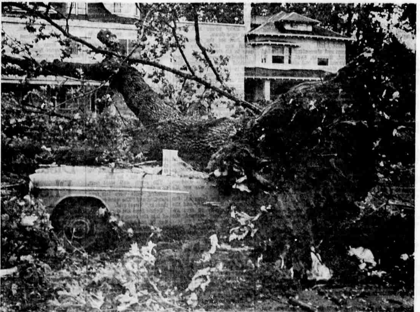
Much of the tree toppling which came yesterday wouldn't have happened in August. As shown above, tree roots surrendered when the winds came — the rains of the past week had made the soil loose and soggy and the roots couldn't hold.