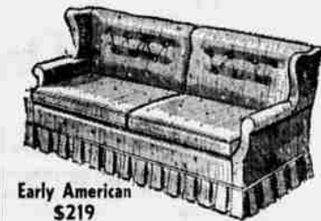
Early American $219

Choose from a large selection of modern, Early American, and contemporary styles—in gold, brown, beige, green and turquoise colors and Early American Prints. In Nylon, Naugahyde, cotton, and rayon fabrics—made by Simmons, Biltwell and others.