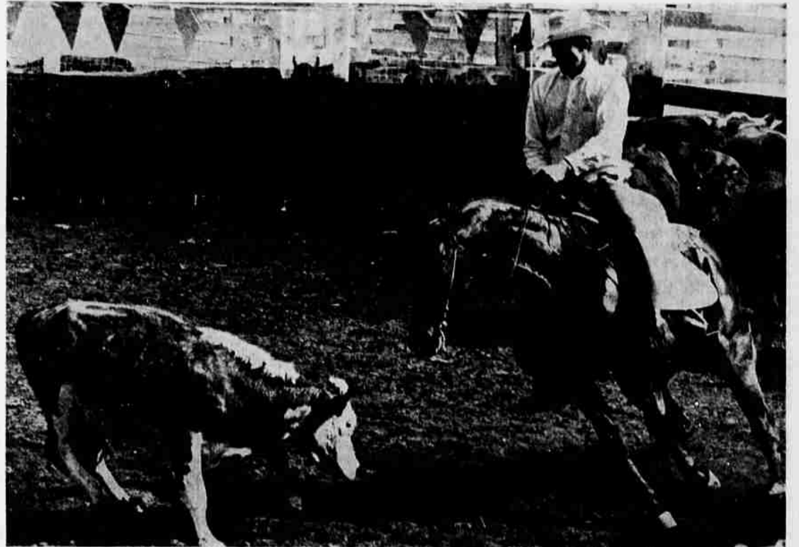
Smart "Cutting" will be one of the events in this weekend's Oregon Quarter Horse Assn. show at the Lane County Fairgrounds. Horses are required to "cut out" a designated cow from a herd without help from the rider, as the

Tickets for the quarter horse show may be purchased from Four H Club members, who earn a commission, or at the Outdoor Store in Eugene or Fee and Richey Jewelers in Springfield. Tickets may be also purchased at the arena door for each performance.