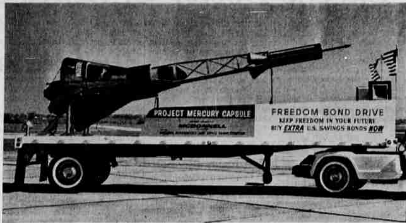
Model This model of the Freedom 7 Mercury Spacecraft will be displayed in Eugene June 2 and 3. The duplicate spacecraft is touring Oregon in connection with the U.S. Treasury savings bond drive.

The McDonnell Aircraft Corp., which designed and built the Mercury capsules for the National Aeronautics and Space Administration, donated the capsule to the Treasury Dept. for its Freedom Bond Drive. The Chevrolet Motor Division of General Motors is providing the truck and trailer on which the capsule is mounted.