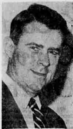
CYRUS R. VANCE Appointment Announced

He was assistant to the president of the Mead Corp. for a short time, then in 1947 joined