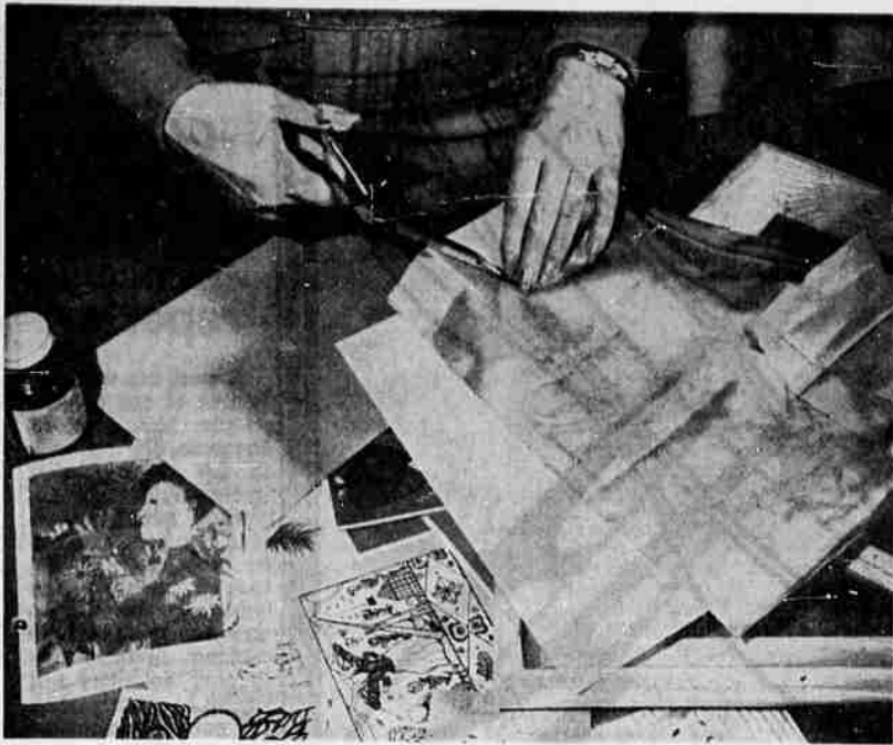
First Step For the first step in making a framed Christmas card picture, select piece of slightly textured fabric to provide an attractive and unusual matting. Cut to fit an 8- by 10-inch piece of heavy cardboard and glue the fabric on board with rubber cement. Inexpensive wooden frames are used to set off the cards.