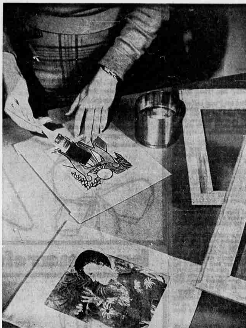
Second Step Select cards you wish to frame and carefully trim off all excess paper. Give the cards three coats of shellac, allowing at least an hour's drying time between coats. When dry, mount on fabric-covered boards, being careful to allow at least a quarter inch more space at the bottom of board than at top and sides.

Further information on the use of the scrubber-polisher or on keeping floors "like new" is available by calling Lane Extension Service, DI 2-1311, Ext. 201, for a copy of the bulletin, "Floors and Their Care."