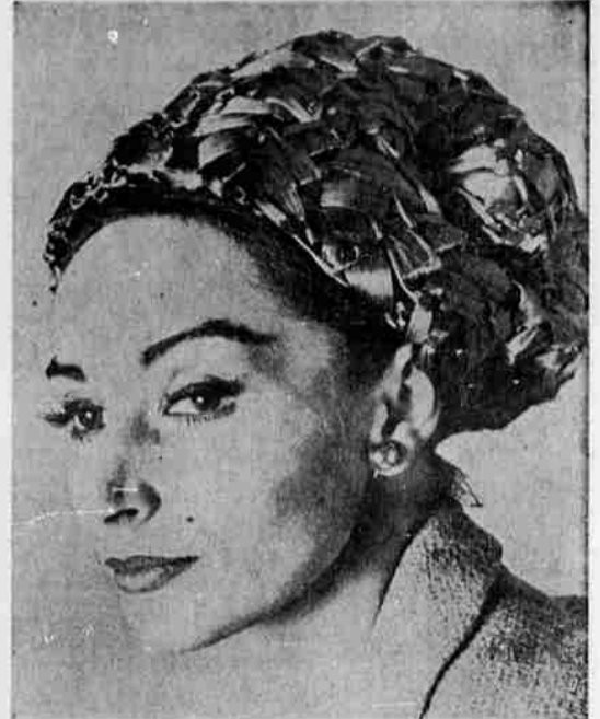
Spring Straw High toque of bronze textured paillasson with back manipulation is by Christian Dior Millinery. Large buttons of the same straw ornament sides of hat.

Some of the brims for spring act as trellises for flowers; others are shirred, veiled, ruffled, or outlined with contrasting fabrics.