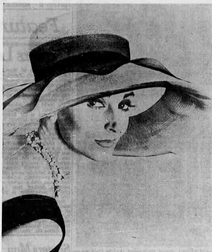
Big Brim Brimmed hats take the place of the pillbox in the spring showings by Christian Dior Millinery. Widths range from the narrow Buster Brown roller to skimmer pictured above, a very large capeline of white horsehair with brims of navy horsehair braid. Trim is simple.

By GAY PAULEY Of the United Press International NEW YORK (UPI)—Big brimmed hats make a comeback for spring, but you're going to need a dictionary to determine the type of brim you're wearing.