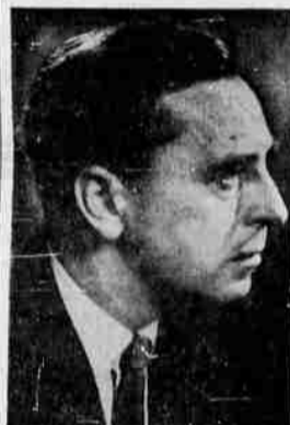
RUDOLF FIRKUSNY In 19th American Season

The Czech-born pianist Rudolf Firkusny will present a Civic Music Assn. recital at McArthur Court Wednesday, at 8 p.m.