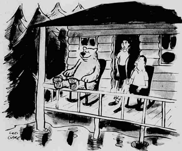
"I'd be satisfied if they weren't quite so tame!"