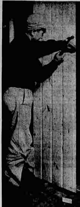
GRAINED PINE — Pine panels were left unpainted to enhance rustic effect. Panels are precut, only need to be nailed up as Skinner is doing.

The George Skinner family of Portland, was bitten by the vacation bug awhile back, and its members did something about it. The Skinnners bought a vacation home—through the mail, you might say. The cabin was shipped in its entirety to them: walls, cabinets, roof, electrical lines—all wrapped in sturdy plastic bags. The cabin was transported to the building site on the shores of the Pacific Ocean and assembled by this do-it-yourself family. The cabin they chose is named the Lodgepole Pine, and is made available by the Western Pine Assn., of Portland. The cabin contains 400 compact square feet of living area including living-dining room, kitchen, bath and separate bedroom. Living space is augmented by a roofed sun deck. The cabin is as sturdily built as a permanent home—even to the extent of double wall construction. The cabin kit included pre-cut lumber, pre-assembled window and door units, pre-built cabinets, electrical fixtures, wiring and such appliances as range with oven, refrigerator with freezer, and hot water heater, shower