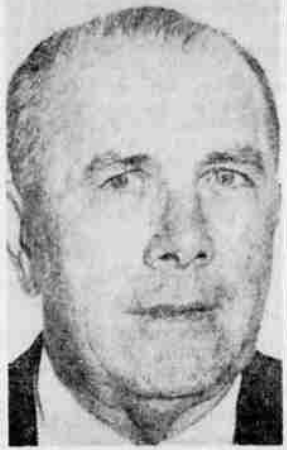
JOHN B. KELLY SR. Dies in Philadelphia