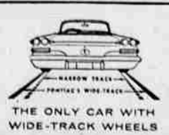
THE ONLY CAR WITH WIDE-TRACK WHEELS

The reason is this: The track (not the body) is wider than any other car. The result is astonishing. You corner more securely, cruise with more confidence, hold a truer course in traffic. The best way, in fact, to measure Pontiac's Wide-Track Wheels is from the driver's seat. Put yourself in this remarkable position soon.