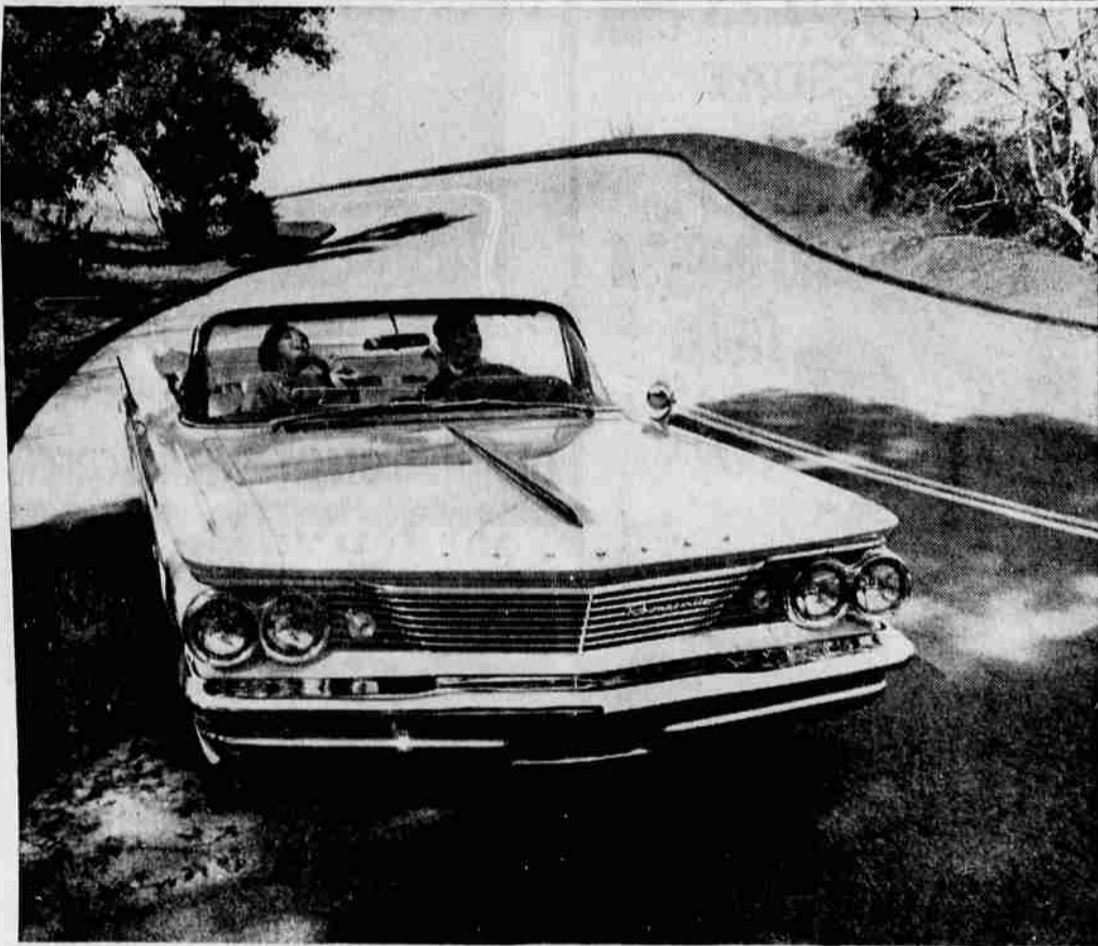
JOIN THE CIRCLE OF SAFETY... CHECK YOUR CAR... CHECK YOUR DRIVING... CHECK ACCIDENTS!

Net with galvanized metal poles, stakes, two shuttlecocks, four rackets, plus case. Special.