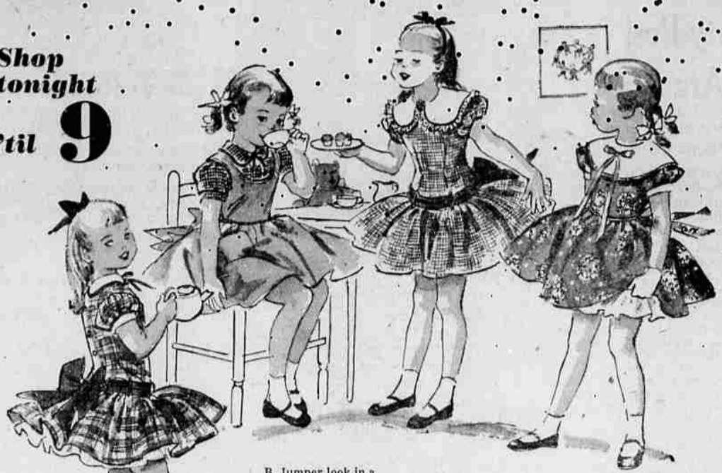
A. Long torso plaid with contrast color sash. White lawn ruffled petticoat. Crisp white collar and cuffs. Assorted dark plaids.