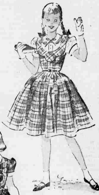
RUFFLED BIB DRESS: Red, green or blue plaids lined with white pique collars and cuffs.

Perfect for now and back-to-school! Crisp, woven cotton dresses that keep their fresh look washing after washing. And the colors! Rich Scotch plaids in the shades that are making fashion news this year. Pamper your little girl . . . and your budget. Buy several now at this savings! Girls sizes 7 to 14.