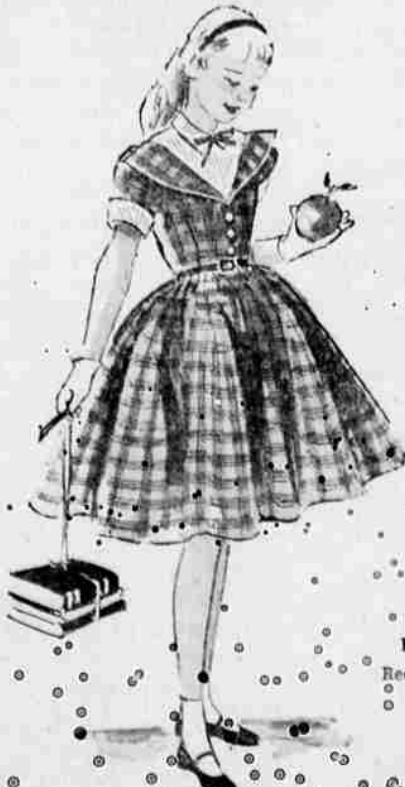
PRETTY WING DRESS: Red or green plaid crisped with white permanent treated cotton bodice and cuffs.