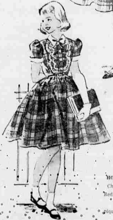
HOP SCOTCH DRESS: Charming jumper-style! Red, green or blue plaids with white polished pique bodice and sleeves.