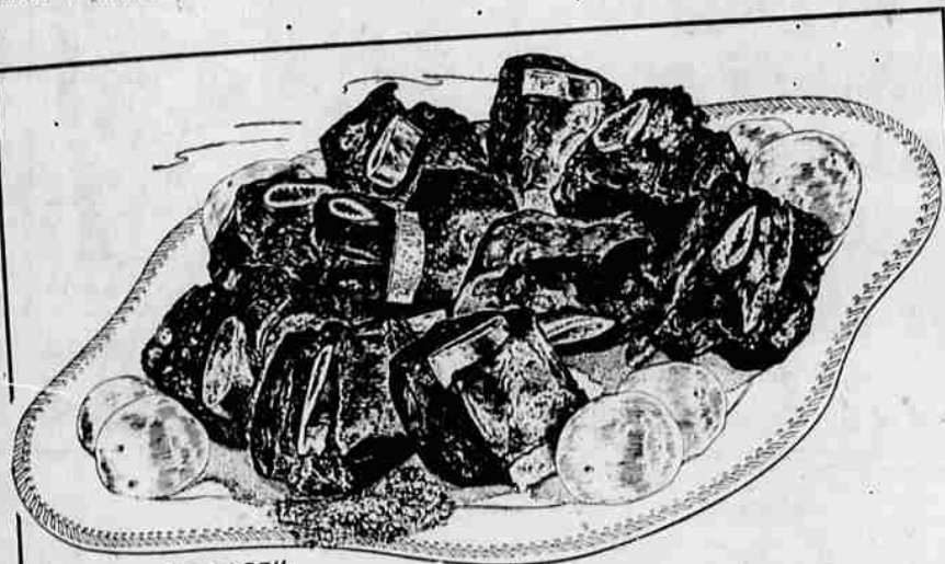
"USDA CHOICE" STEER BEEF