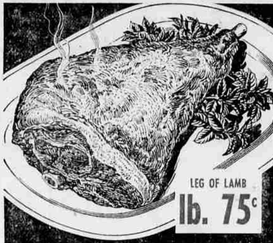
LEG OF LAMB lb. 75 c

Time again to enjoy the wonderful goodness of spring lamb—the meat that's famous for rich, full flavor and delicate texture. It's featured this week at Safeway—Spring Lamb at its very best. You see, we sell only "USDA CHOICE" grade—and we prepare this fine meat for market with special care so it reaches you at its peak of tenderness and flavor.