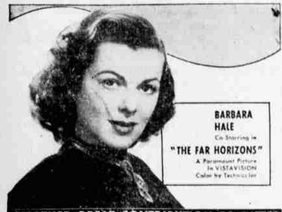
BARBARA HALE Co-Starring in "THE FAR HORIZONS" A Paramount Picture in VISTAVISION Color by Technicolor