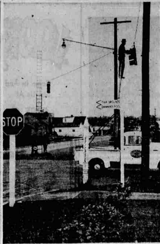
NEW CONTROLS —Stop lights were installed Thursday at the intersection of Jefferson and 18th Ave. Crews worked through the day and had the signals operating before the 5 p.m. traffic peak on the 2 westside arterial streets. Another set of traffic lights soon will be installed at 11th and Lincoln.