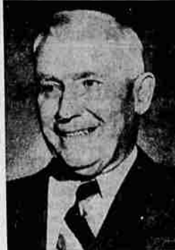
DR. CHARLES E. FULLER in January, enters his 30th year of broadcasting. His voice has been heard around the world on the ever popular "Old Fashioned Revival Hour."

Dr. Charles E. Fuller, pioneer radio pulpiteer, will in January enter his 30th year of continuous broadcasting.