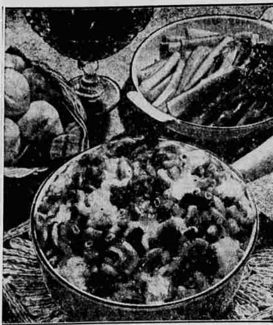
RUBBLING HOT and rich, this casserole tempts folks right to the table. Macaroni, rich red tomato soup, cheese and ground beef blend flavors in this Tomato Beef-Aroni Casserole.