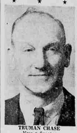
TRUMAN CHASE Now a Senator