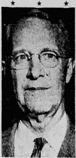
CLARENCE HYDE Former Representative

sales tax or an increase in the income tax.