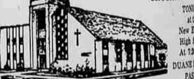
"The Church With the Lighted Spire"