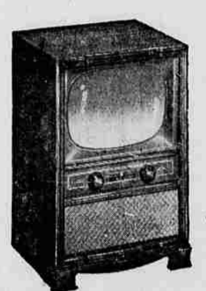
NEW—21" TV REG. 349.95

17-in. VHF no-glare safety glass. Smart leather-grained plastic covered cabinet. Convertible to UHF. Price includes Federal tax and a full-year warranty on all parts and picture tube.