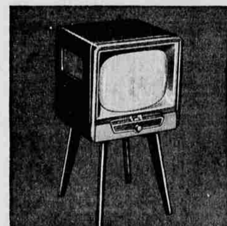
REG. 239.95 21-IN TV 209.77

Now sale priced. Airline with all 82 VHF channel reception. Safety glass ends glare. One knob tuning. Switch channels—retains original crisp picture, resonant tone. Federal tax and full year warranty included.