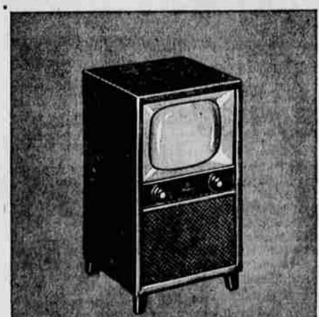
REG. 235.95 17-IN. TV 169.77

Now sale priced. Airline with all 82 VHF channel reception. Safety glass ends glare. One knob tuning. Switch channels—retains original crisp picture, resonant tone. Federal tax and full year warranty included.