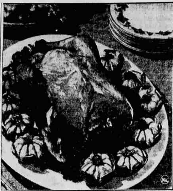
IT'S TRADITIONAL this time of year to have tangerines around the house, and you'll find they're as tasty warm as they are cold. Recipe elsewhere on this page.

PORTER-SCARPELLI MACARONI CO., PORTLAND, OREGON