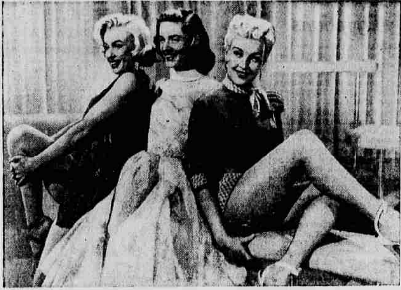
THREE LOVELY LADIES, Lauren Bacall, center; Marilyn Monroe, left, and Betty Grable, right, star in the luscious Technicolor production by 20th Century Fox, "How to Succeed in Business Without Really Trying." The show will start Christmas Day at the McDonald Theater.