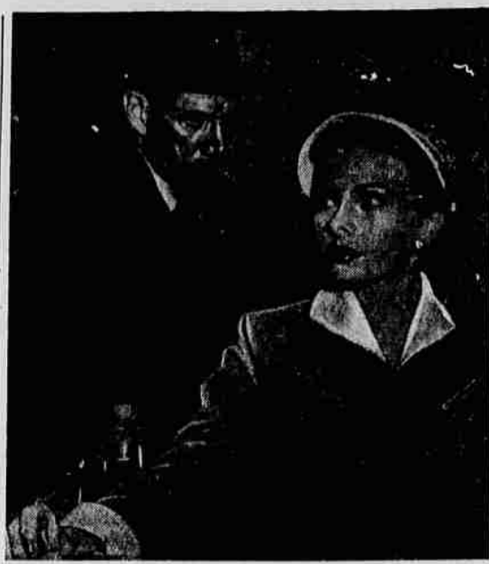
JEANNE CRAIN is a prime suspect in the mysterious murder of her sister and is shown here being grilled by police detective Richard Boone in "Vicki," playing at the McDonald Tuesday.