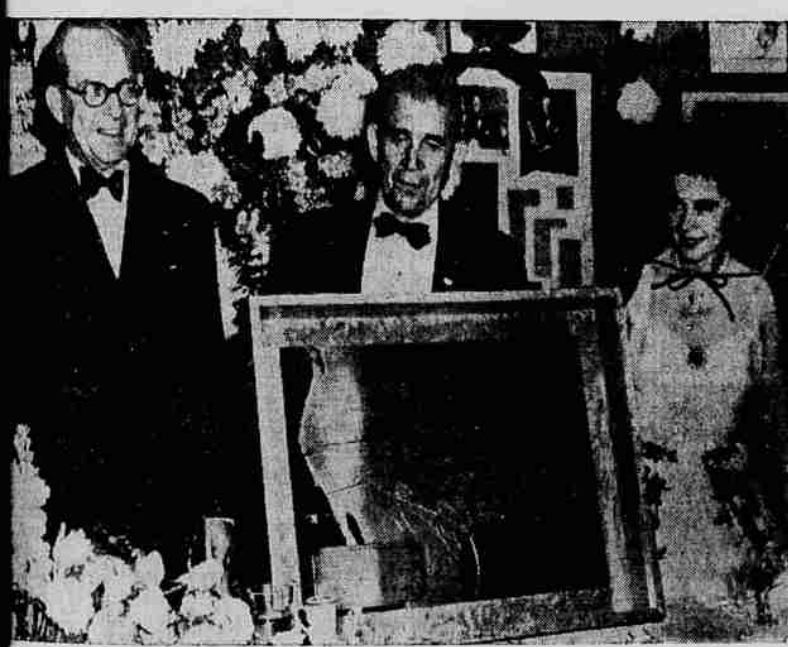
THEIR TOUR IN SILVER —King Paul and Queen Frederika of Greece are presented with a silver plaque mapping the route of their tour across the United States. A diamond marks New Orleans on the map. Making the presentation is Louisiana Governor Robert Kennon (center) at dinner in New Orleans honoring the royal visitors.