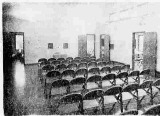
JUNIOR HIGH SUNDAY SCHOOL DEPARTMENT ASSEMBLY ROOM AND CLASS ROOM