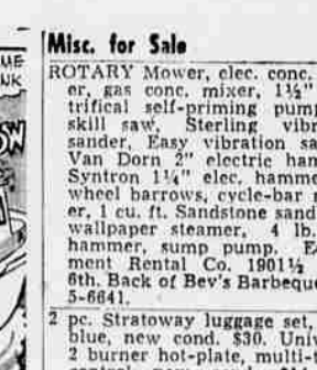
MISC. FOR SALE 610

Misc. for Sale 610 Sale or trade: '40 Hudson, 4 dr. Record, new tires, new muff. fire, new rear fenders, & will paint any color desired. Also a Leonard refig., oil stove, with tank & oil line, & 1 full size bed springs. Ride, sleep, be cool & warm. Also satisfied. Will trade for '04 or '74 pickup. 2846 High St.