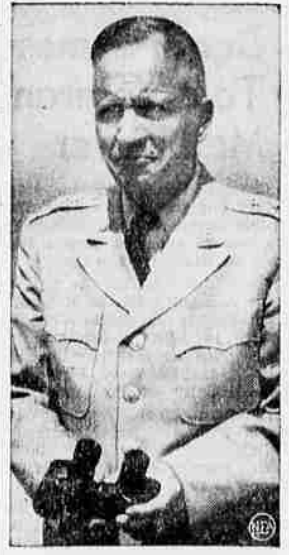
U.N. TRUCE CHIEF —Maj. Gen. William K. Harrison, above, has been appointed head of the U.N. truce delegation at Panmunjom. He replaces Vice Adm. C. Turner Joy, who returns to the United States to assume command of the United States Naval Academy.

The Defense Department had $18½ billion still available for obligation as of May 1. Of that $14 billion 100 million dollars was for ordering hard goods items.