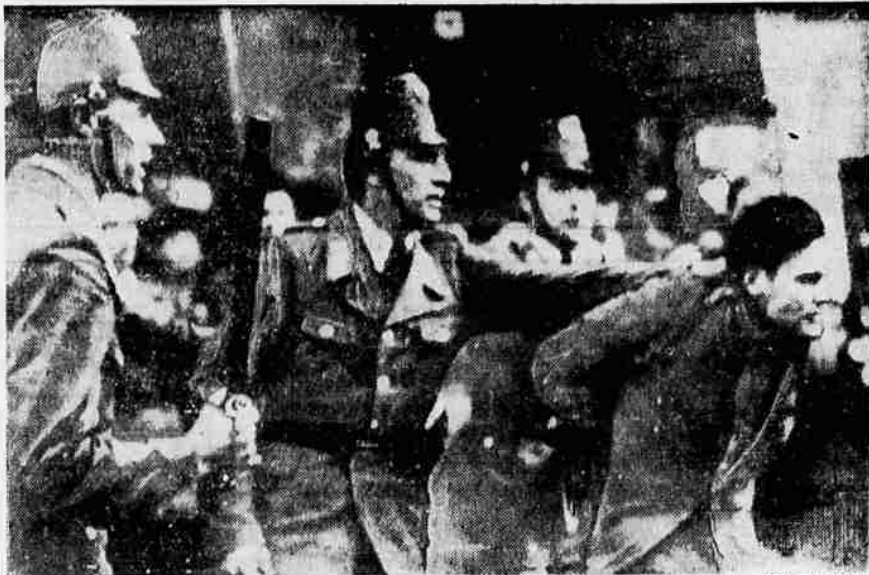
REDS RIOT IN BERLIN —A West German policeman grabs one of the 6000 Communist youths who attempted to invade the American sector of Berlin. Police used tear gas to quell the riot which came on the heels of the peace treaty signed between the Allies and the German Federal Republic.

76 W. Broadway—Eugene 643 Main—Springfield