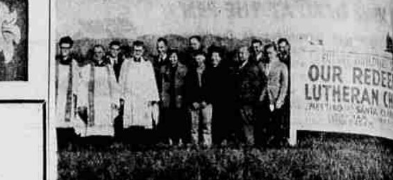
OUR REDEEMER LUTHERAN CHURCH

YOUTH FOR CHRIST—7:30 p.m. Saturday (March 1) rally at Woodrow Wilson Junior High School.