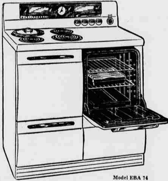
Model EBA 74