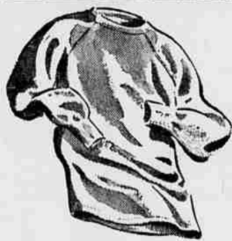
Raglan Sleeved SWEAT SHIRTS

Flat knit cotton . . . fleece lined! Raglan sleeve style with crew neck. In colors silver grey, yellow, gun metal, red, white. Value!