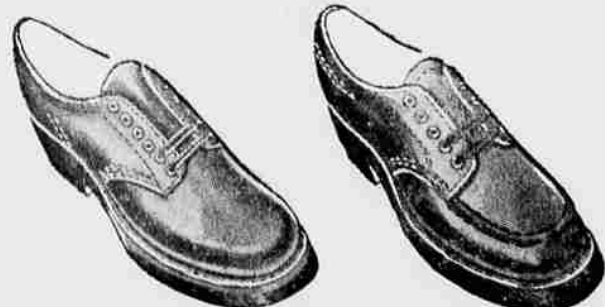
Flexible Vulcork Sole WORK OXFORDS