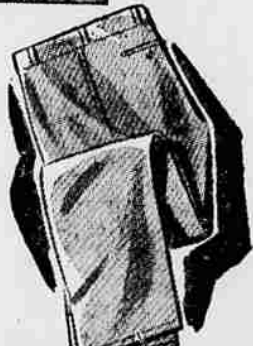
Sanforized WHIPCORD PANTS

Sanforized, warm, long wearing whipcord. Button fly front. Precision cut for better fit. Sizes 29 to 44.