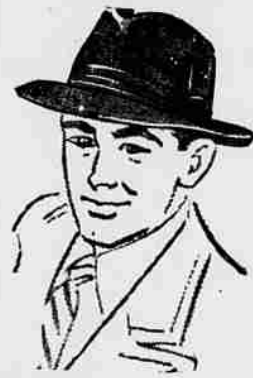
Plastic Covered POPLIN HATS

Water repellent finish, resin plastic treated . . . holds shape better. Sizes 6 7/8 to 7 3/4.