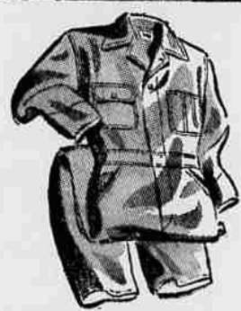
Sanforized WORK SUITS

2-way zipper, snap fastener, side opening. Designed with action back full cut! Choose grey fisher, blue denim, blue and gold stripe, white herringbone. Sizes 36-50.