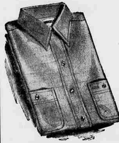
Men's Blue CHAMBRAY SHIRTS

Sanforized . . . Smoothly lined dress type collar . . . long tails! Generously cut for freedom of action. Built stronger to last longer! Sizes 14 1/2-17.