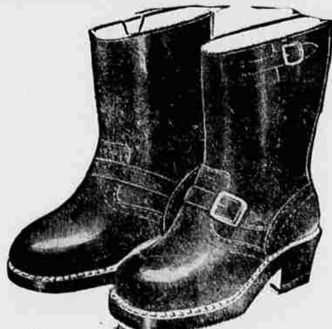
Long Wearing ENGINEERS BOOTS