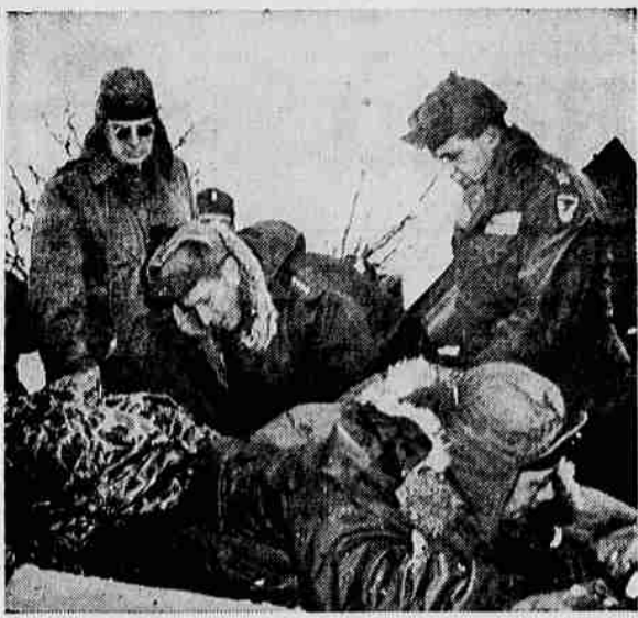
GENERAL AIDS INJURED PARATROOPER —Gen. Mark Clark (center, background) helps tuck in a paratrooper injured in the mass jump of the 11th Airborne Division during "Operation Snowfall" at Camp Drum, N. Y. Eight were killed and 126 injured in the maneuvers. One man was killed in the jump, three others died in the crash of a troop transport and two were fatally injured in a truck-train crash.