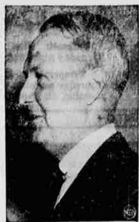
DAVID K. BRUCE, U. S. Ambassador to France, has been named by President Truman to be Secretary of State Acheson's No. 1 aide.

He was acclaimed First Citizen at a Chamber of Commerce banquet Wednesday night.