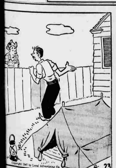
housing situation is bad here but they do have wonderful service at COX'S SELF SERVICE LAUNDRY."