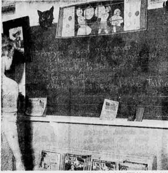
LEARNING TO BE a good messenger isn't as easy for the children of Fairview as it might be for children in conventional schools. A student studies the instructions written on the board in one of the school's make-shift classrooms. If she studies hard, she may be paroled and find a job on the outside.

Snell Cottage, a fireproof brick structure, houses the infants. They live there regardless of the degree of mental deficiency. After they