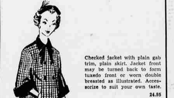
Checked jacket with plain gab trim, plain skirt. Jacket front may be turned back to form tuxedo front or worn double breasted as illustrated. Accessorize to suit your own taste. 24.95

WE CARRY PAGE BOY FASHIONS AS FEATURED EDITORIALY IN GOOD HOUSEKEEPING