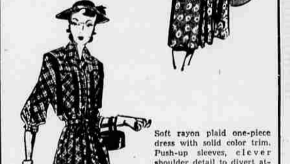
Soft rayon plaid one-piece dress with solid color trim. Push-up sleeves, clever shoulder detail to divert attention from you-know-where. Concealed drawstring expansion feature insures even hemline. 14.95

"From top to toe everything for the expectant mother"