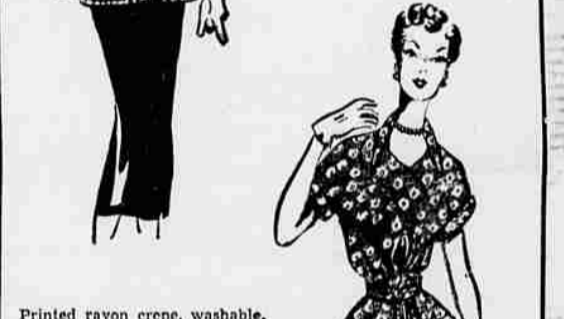
Printed rayon crepe, washable, of course. Collar and yoke treatment direct attention upward. Front drape and side pockets suggest the peg-top skirt trend. 10.95