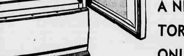
Two Ovens in This Frigidaire Electric Range Bake and roast, or broil and roast all at once in two Twin-Unit, Even-Heat Ovens. Automatic Cook-Master Oven Clock Control cooks a whole meal while you're away. Fast-cooking, 5-Speed Radiant Tube Units. Thermizer Deep-Well Cooker. Many other exclusive features in this — the finest electric range ever built. Model RK-70 $229.75 6 other models from $154.75