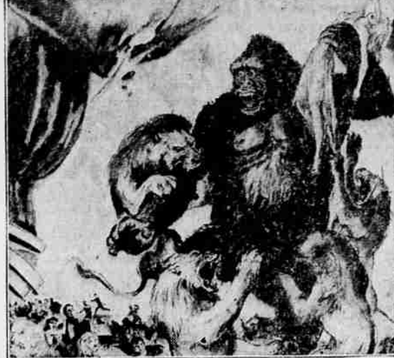
"MIGHTY JOE YOUNG" displays his prowess as the pet of society in the unusual film offering at the Heilig Sunday through Wednesday. Terry Moore and Ben Johnson take the human leads in the adventurous drama. Continuing as second run feature is "Make Mine Laughs," starring Joan Davis.

HEILIG Sunday thru Wednesday "Mighty Joe Young" and "Make Mine Laughs" Thursday thru Saturday "Lady in a Jam" and "Lady from Cheyenne" MAYFLOWER Sunday thru Wednesday "Lady in a Jam" and "Lady from Cheyenne" Thursday thru Saturday "Mighty Joe Young" and "Make Mine Laughs" LANE Sunday and Monday "Whispering Smith" and "Black Eagle" Tuesday and Wednesday "Night Has a Thousand Eyes" and "Shaggy" Thursday thru Saturday "Big Jack" and "South of St. Louis" MCKENZIE Sunday thru Tuesday "Neptune's Daughter" Wednesday thru Saturday "Doolins of Oklahoma" and "Johnny Allegro" VARSITY Sunday thru Tuesday "Treasure of Sierra Madre" and "Johnny Belinda" Wednesday thru Saturday "Feathered Serpent" and "SOS Submarine" DRIVE-IN THEATER Sunday thru Tuesday "My Dream Is Yours" and "Johnny Allegro" Wednesday thru Saturday "It Happens Every Spring" and "Allas Nick Beal"