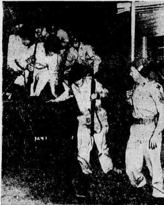
GUARDSMEN ANSWER RIOT CALL —Florida National Guardsmen jump from truck as they arrive to quell a mob uprising in Groveland, Fla., where three Negro shacks were set afire by roving bands. The disturbance occurred when several Negroes were jailed on robbery and rape charges. The leader of the mob warned the Guardsmen to "get the hell out of town." They withdrew to a bivouac area nearby.

Court attaches said it was the first time in their memory that a negro had served on a grand jury though they have sat on juries in lesser cases.