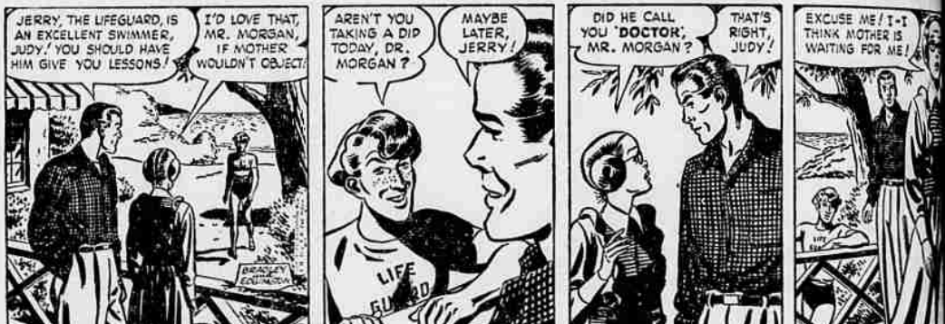
REX MORGAN, M. D.