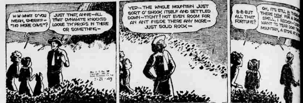
LITTLE ORPHAN ANNIE

Mrs. Clark Takes Over WASHINGTON — (AP) — Mrs. Georgia Neese Clark, new treasurer of the United States, Thursday was entrusted with the government's currency, cash and securities worth $27,424,541,375, 78 2/3.