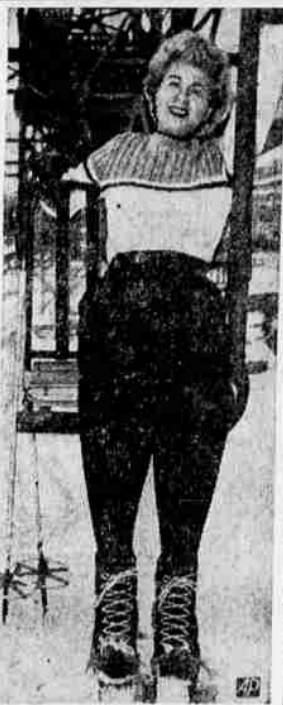
UP IN THE WORLD —Shelley Winters, young actress, rides the 11,005-foot Baldy Mountain chairlift to the summit while on a skiing vacation at Sun Valley, Idaho.

Monitor Electric Range Reg. 289.95 Sale 215.95 Monitor Refrigerator Reg. 354.00 Sale 199.95 Signart Electric 856 Willamette Ph. 718