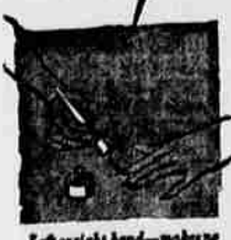
Left/right hand—makes no difference! You're an expert, with the lucite plume!

Lastron goes on like a breeze—dries in split seconds—ends smearing, peeling, chipping worries! Wear? With a charmed life! Beautiful bottle! Exclusive lucite plume balances your hand, makes you expert at applying enamel. Discover Lastron today! .60 plus tax.