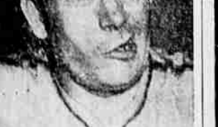
Jimmie Dykes, former skipper of the Chicago White Sox and later the Hollywood Stars, will do his comic antics for the Philadelphia Athletics this year, as a coach.

JIMMIE DYKES , former skipper of the Chicago White Sox and later the Hollywood Stars, will do his comic antics for the Philadelphia Athletics this year, as a coach.