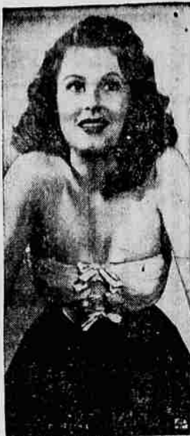
ACTRESS—Ariene Dahl poses in costume at Hollywood while resting between scenes in her role in a forthcoming motion picture which is set in time of the French Revolution.

The most eastern point in the United States is West Quoddy Head, a Maine cape.