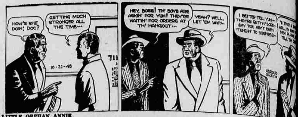
LITTLE ORPHAN ANNIE