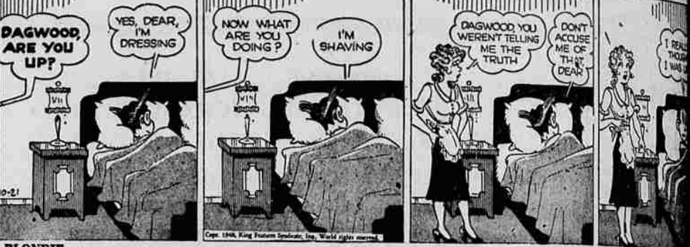
DAGWOOD ARE YOU UP?