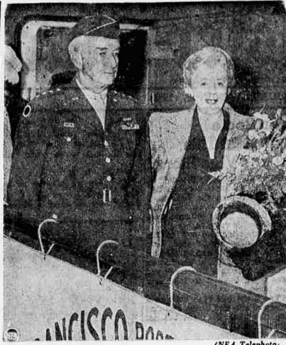
Lt. Gen. and Mrs. Robert L. Eichelberger walk down the gangplank of the Army transport Gen. Buckner after their arrival in San Francisco from Yokohama, Japan. The general, former commander of the Eighth Army, is en route to Washington to retire after 43 years of military service. The general was greeted with a hero's welcome.

SINGER SEWING CENTER 1032 Willamette Phone 1358