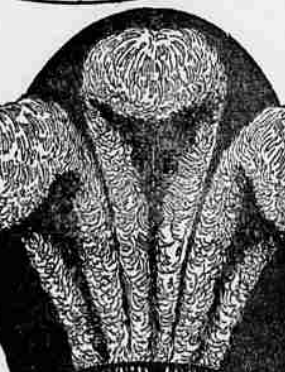
Judge its GENIAL CHARACTER