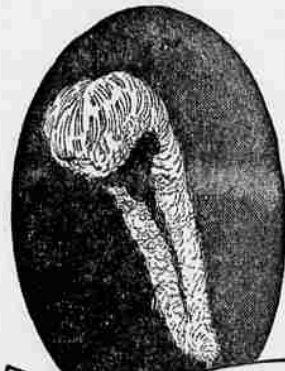
Judge its NOBLE FLAVOR

Finest bottling in all our 65 years—look for the new quality bottle