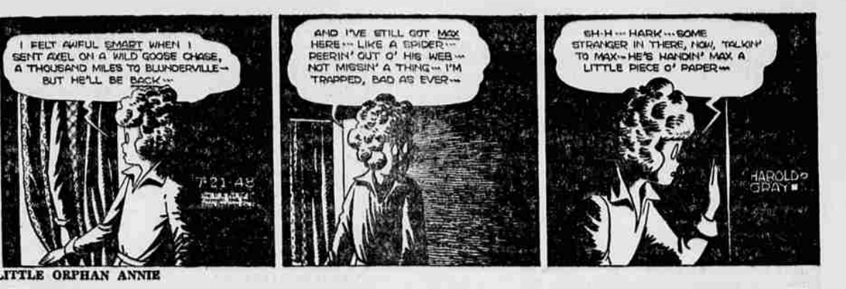
LITTLE ORPHAN ANNIE